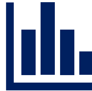
Persistent score gaps between ELs and Not ELs