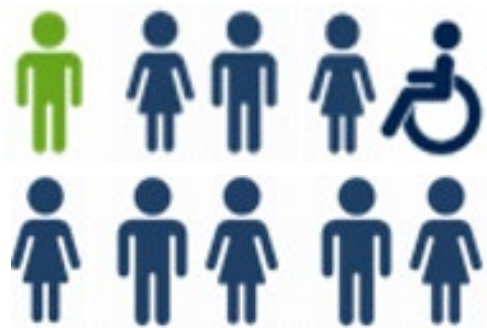
U.S. English learners (5 million students)