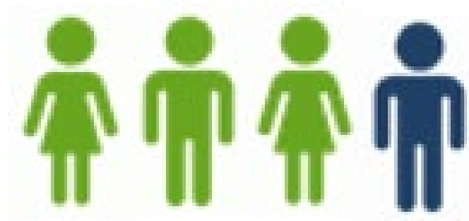
ELs who identify Spanish as their home language