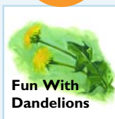
Fun With Dandelions