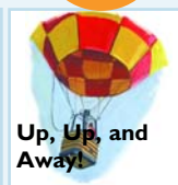
Up, Up, and Away!